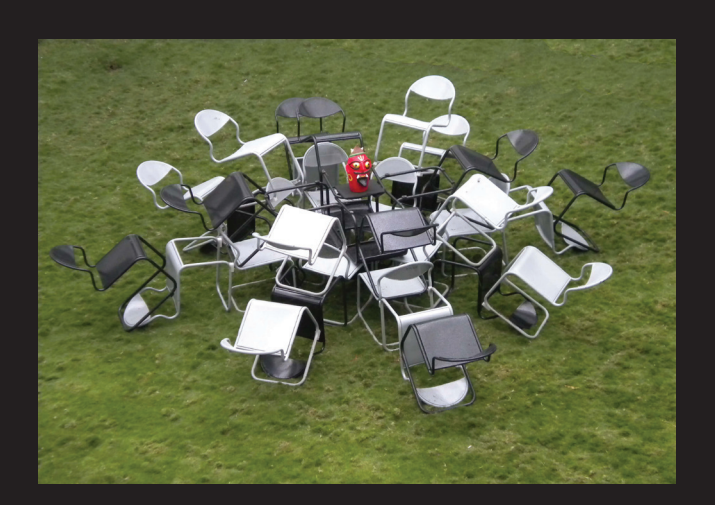
An installation evoking the emotional contrast between the attracting nature of a flower as against the repelling nature of an evil eye doll