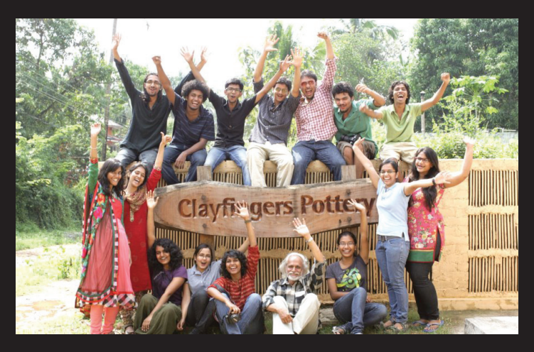
Students and the Dean DJAD at Clayfingers Pottery, Thrissur, Kerala for an electives workshop