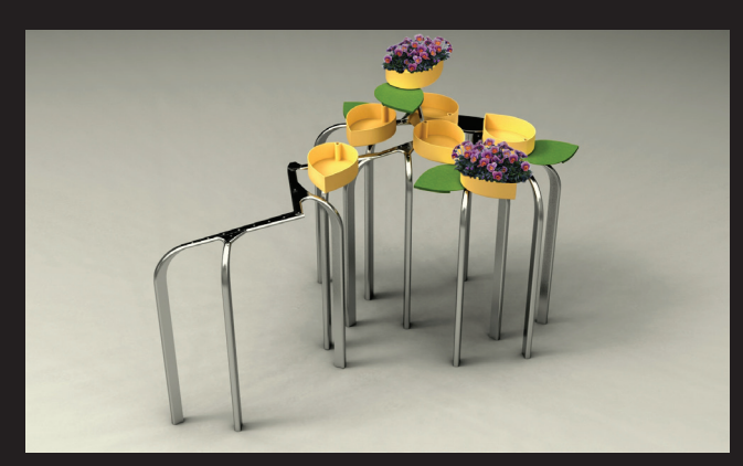
Modular planters for an appartment Catagory life style accessories