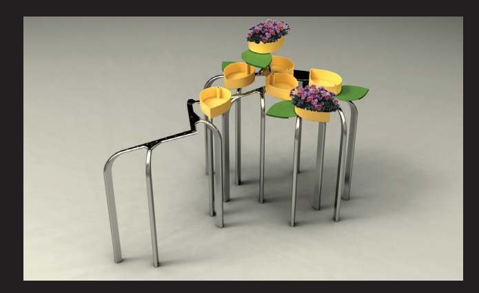
Modular planters for an appartment Catagory life style accessories