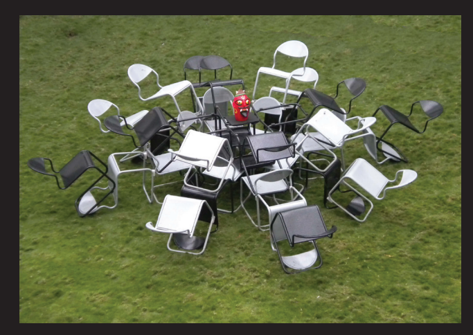
An installation evoking the emotional contrast between the attracting nature of a flower as against the repelling nature of an evil eye doll